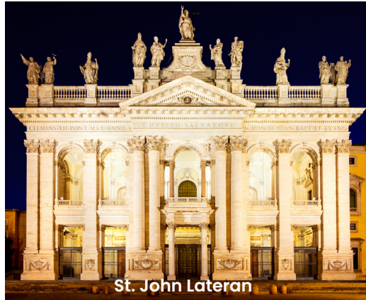
St. John Lateran